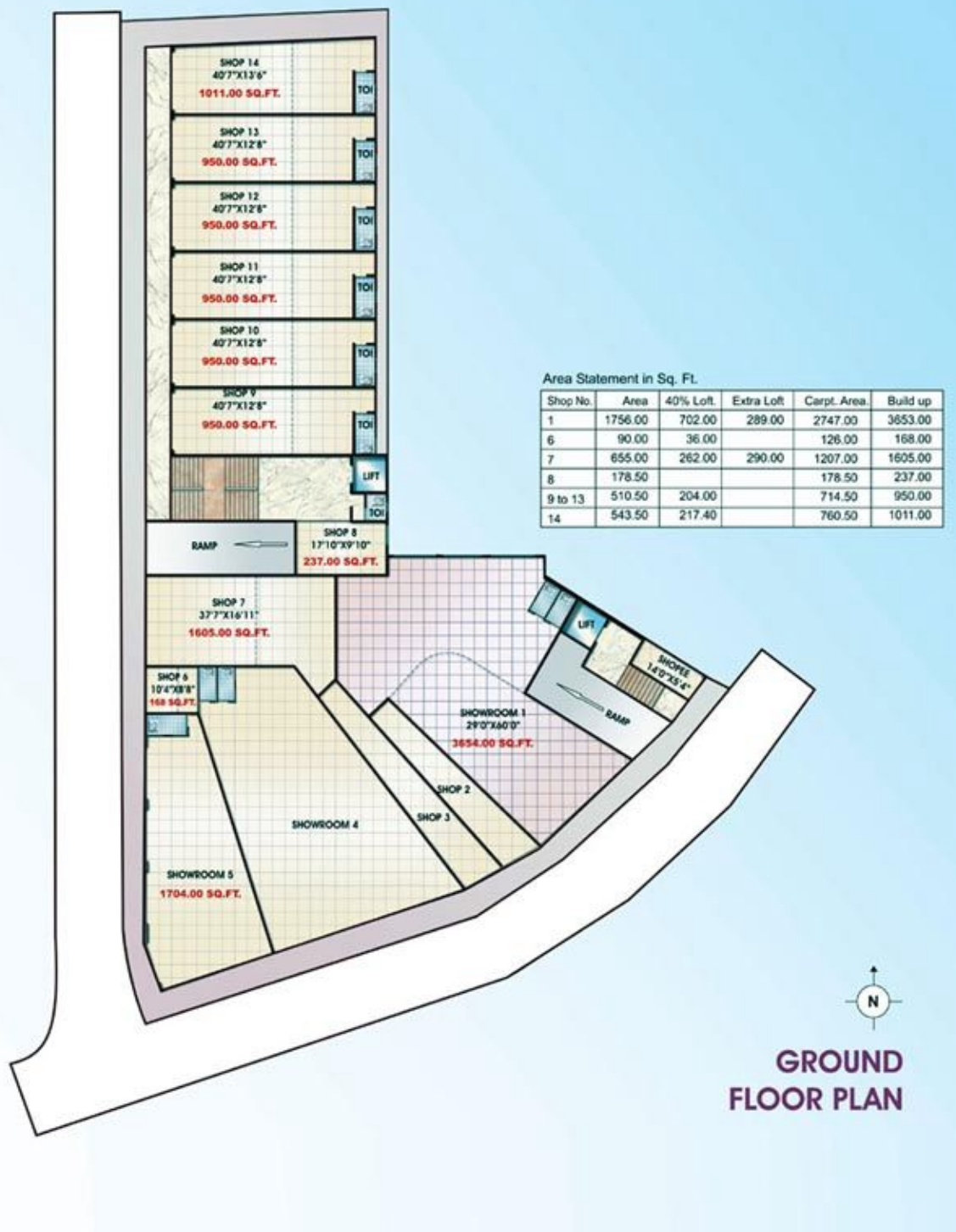
Area Statement in Sq. Ft.